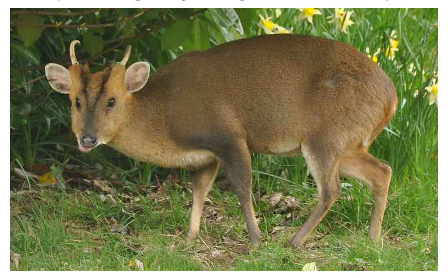
Nilfanion (Own work) [CC BY-SA 3.0 (http://creativecommons.org/licenses/by-sa/3.0

At least seven species of Muntjac are known, with a natural distribution from Pakistan to Java and north to mainland China. They were first introduced to Woburn Park, Bedfordshire in the early 20<sup>th</sup> Century from China. Prehistoric remains that have been found date back to between 15 and 35 million years making Muntjac among the oldest of deer species.